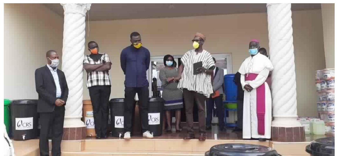
Source: <u>http://newswatchgh.com/crs-caritas-ghana-support-health-facilities-in-</u> techiman/?fbclid=IwAR28M2y9ucAW7SuozxLpFePK9L4_bqQAf9D8RUmYSJusjCF9R5gSxsb0tO8

Also, the Catholic Relief Services (CRS) in collaboration with Caritas Ghana, has donated items to the Catholic Diocese of Techiman in Ghana to support Catholic Health facilities in the fight against COVID-19 pandemic in the Bono East Region of Ghana. The items include 100 hand washing buckets and accessories, tissues, hand sanitizers, bleach, liquid soap and visual education materials worth $10,000.